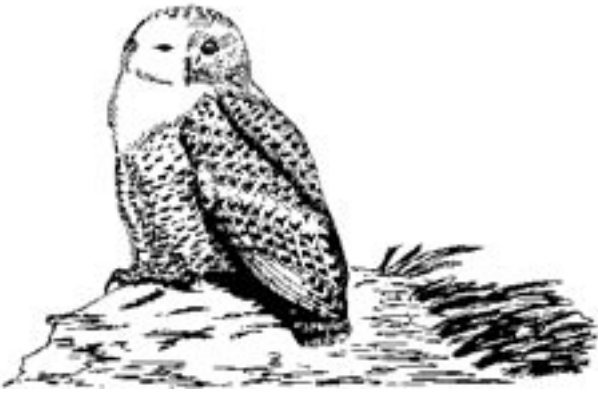
Snowy Owl by Steven D'Amato

Non-Profit Org. U.S. Postage PAID Permit No. 55 Oxford OH